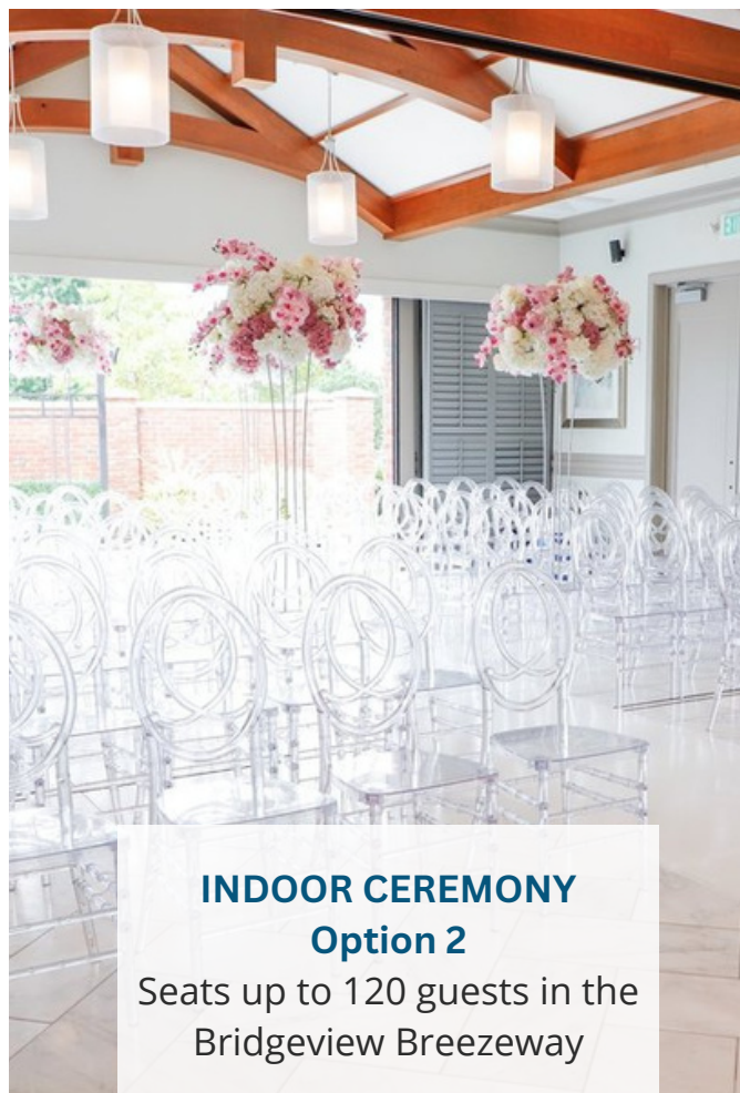
INDOOR CEREMONY Option 2 Seats up to 120 guests in the Bridgeview Breezeway