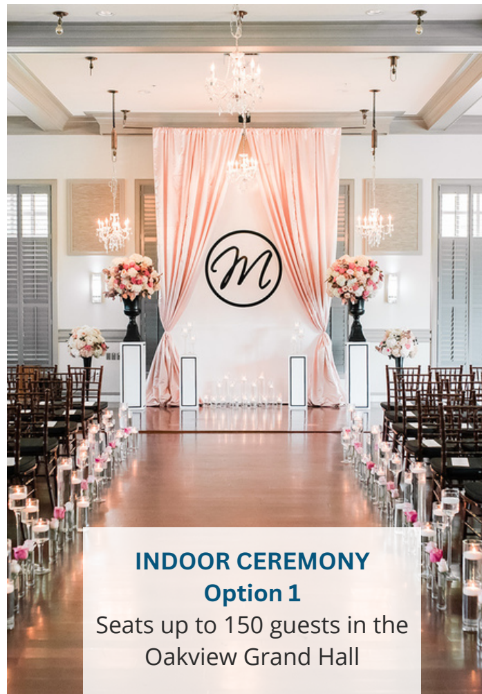
INDOOR CEREMONY Option 1 Seats up to 150 guests in the Oakview Grand Hall