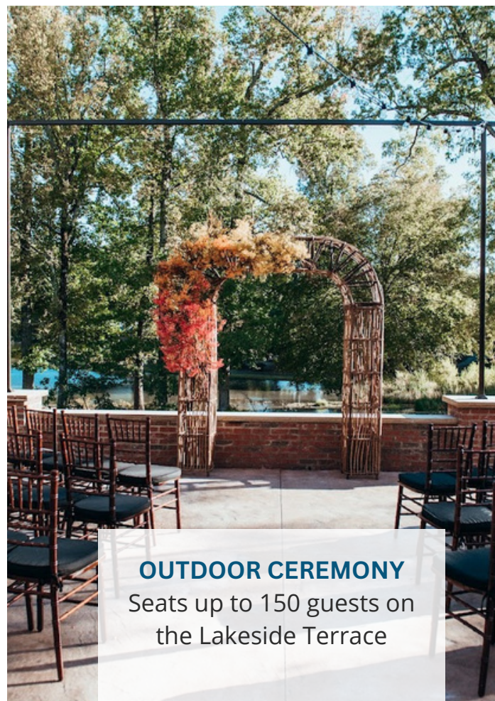
OUTDOOR CEREMONY Seats up to 150 guests on the Lakeside Terrace